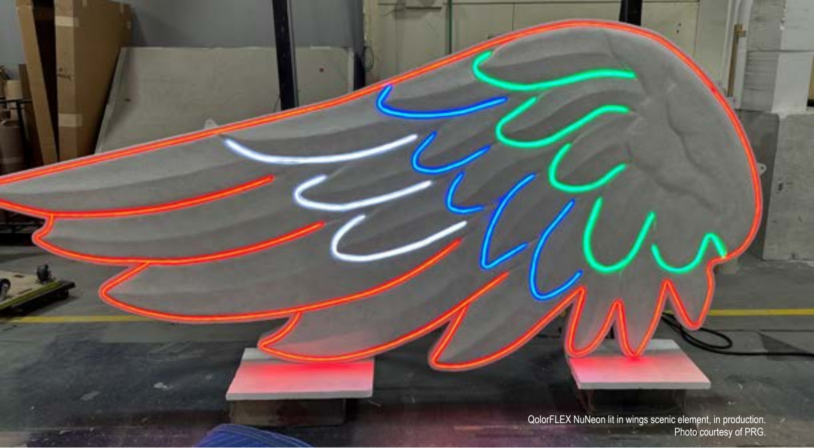
QolorFLEX NuNeon lit in wings scenic element, in production.

at hand with a few fabrication techniques, we ended up with a product we're really proud of.