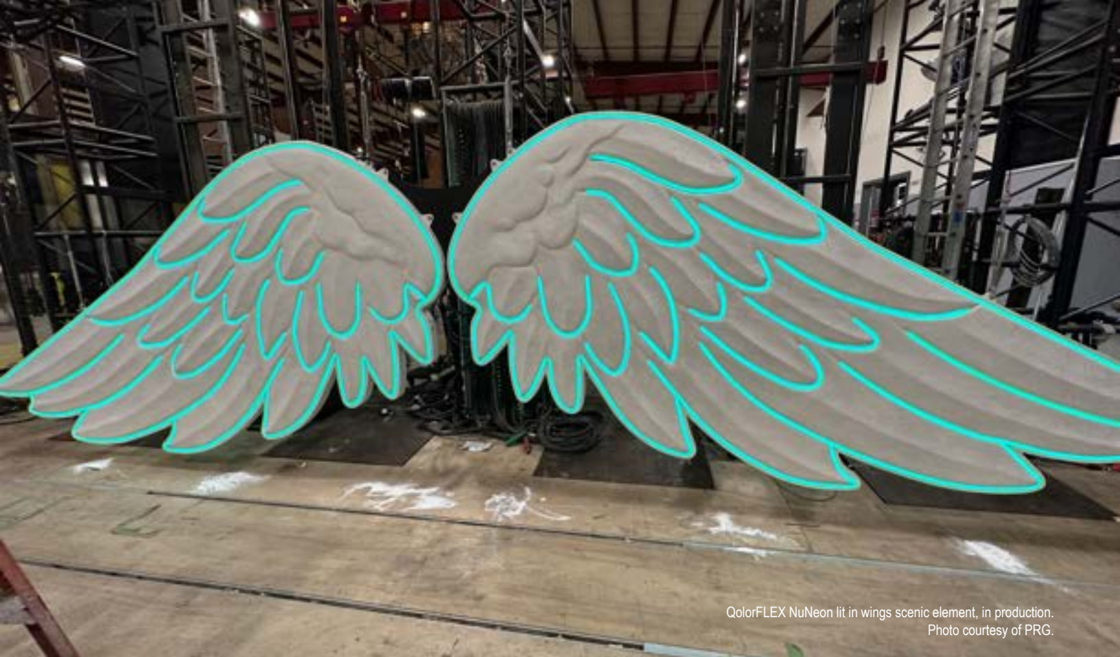
QolorFLEX NuNeon lit in wings scenic element, in production.